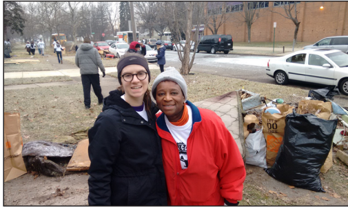
2017 Detroit Trip